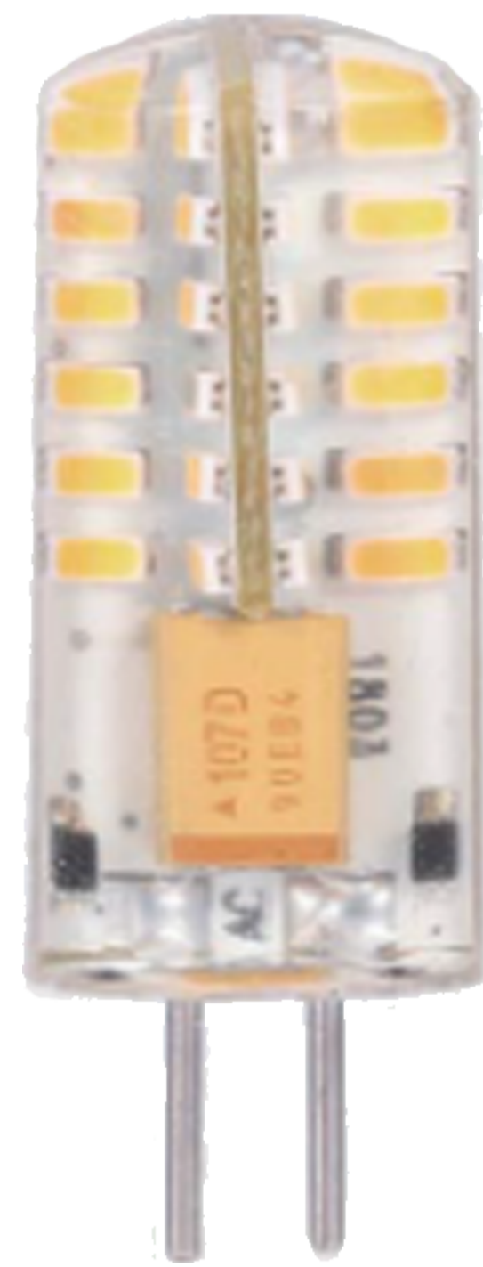
G4 - 2.5W