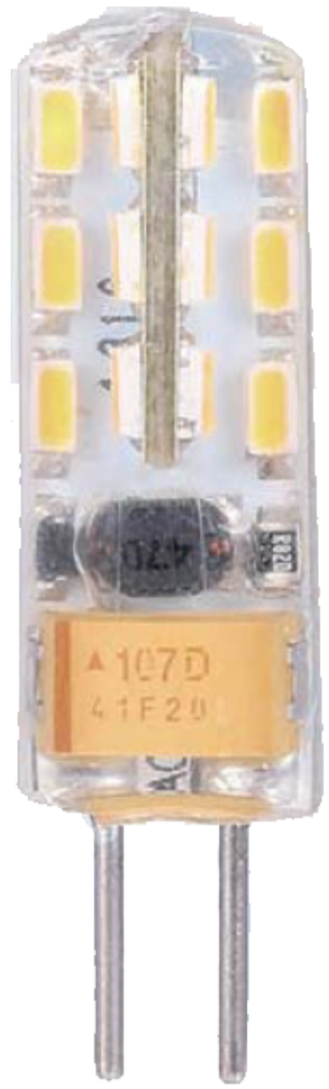
G4 - 1.5W